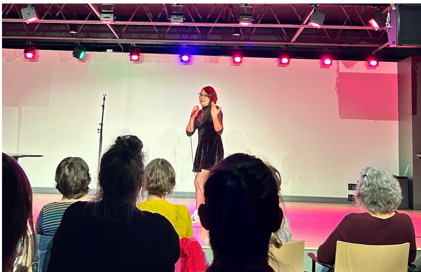
Student showcase, Fall 2024

Schedule: July 1 to August 5 Tuesdays from 6:30 PM to 8:30 PM